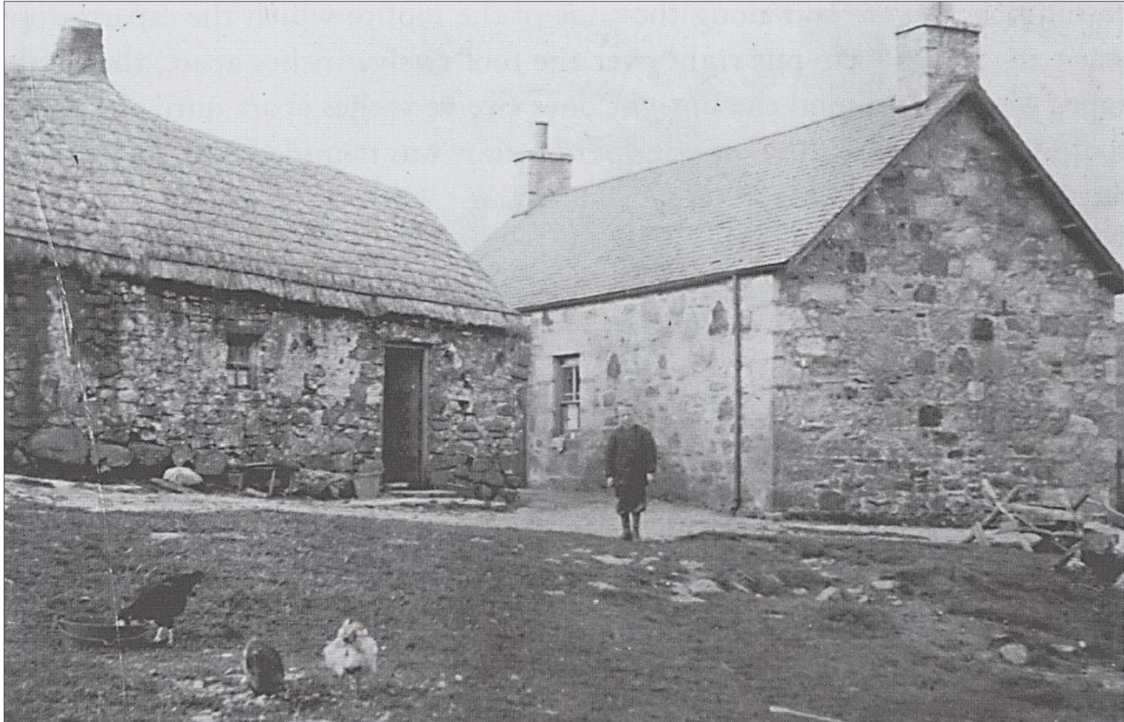
Fig. 3 Buskhead, Glenesk, c.1910. The thatched farmhouse of the cash books stands alongside its slate-roofed replacement.