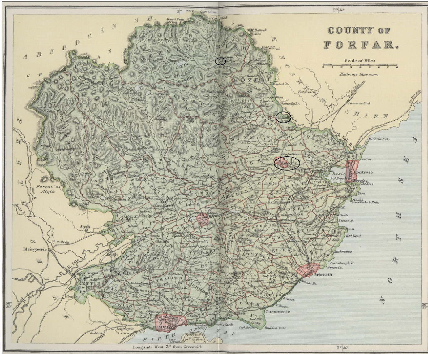
Fig. 2 Forfarshire in the 1890s. Edzell, Brechin and the location of Buskhead have been circled. (From Groome, F H. Ordnance Gazetteer of Scotland , 6 vols, London, 1894-5, volume III)